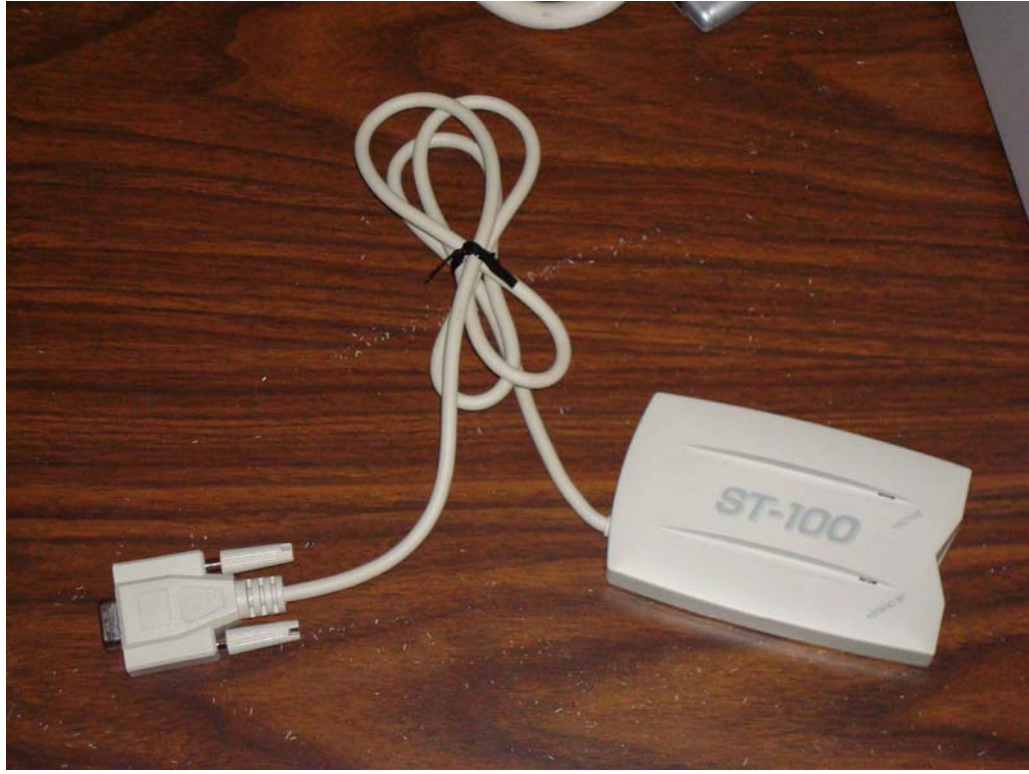
Spyrus Voter Card Encoder and Smart Cards